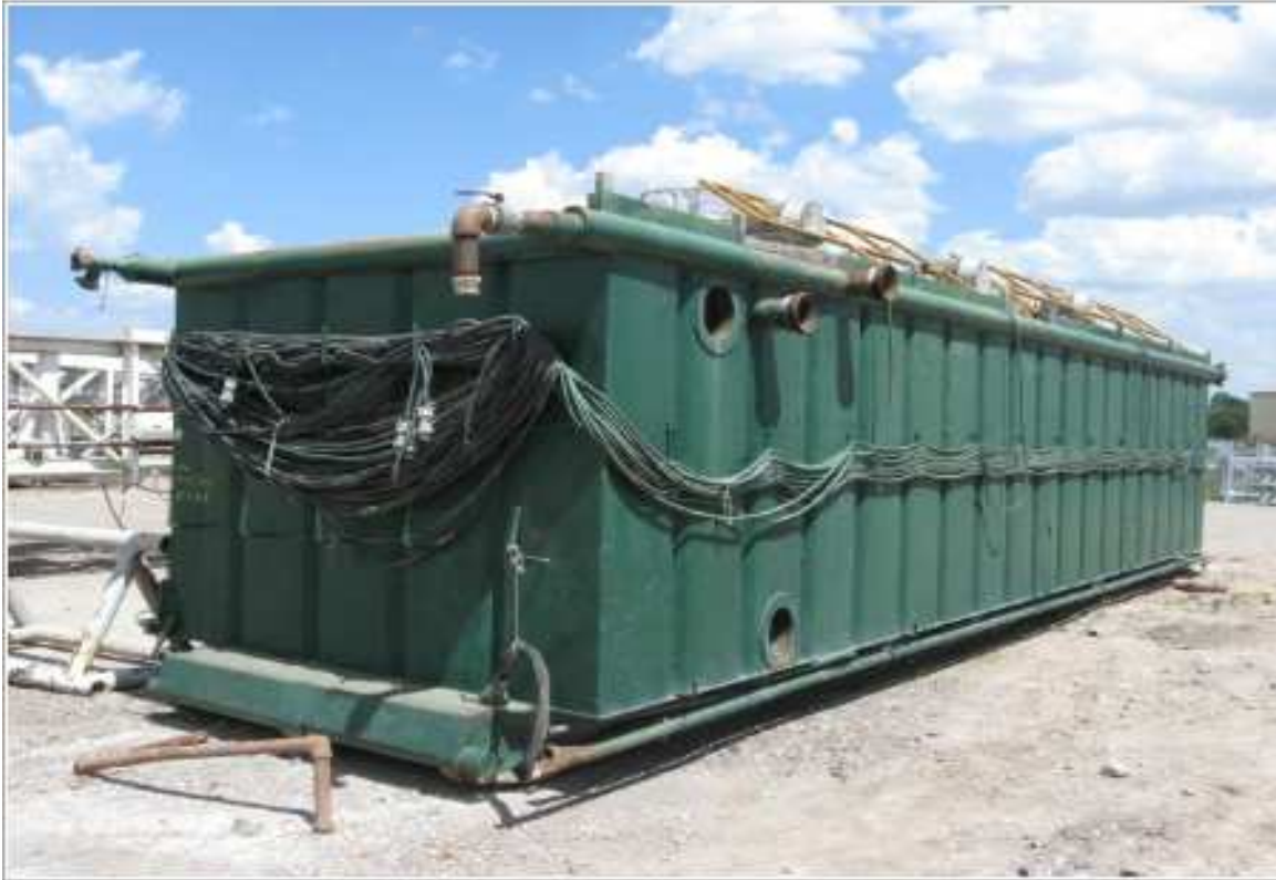
350 BARRELS CAPACITY HOLDING TANK