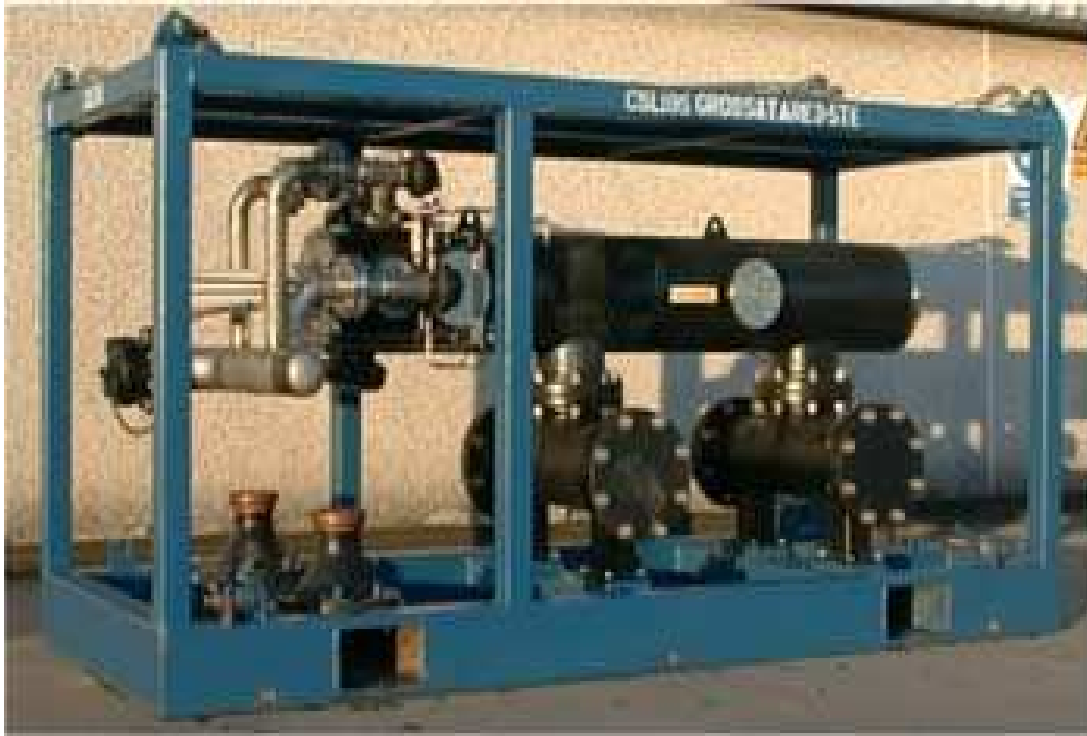
Water filtration Unit